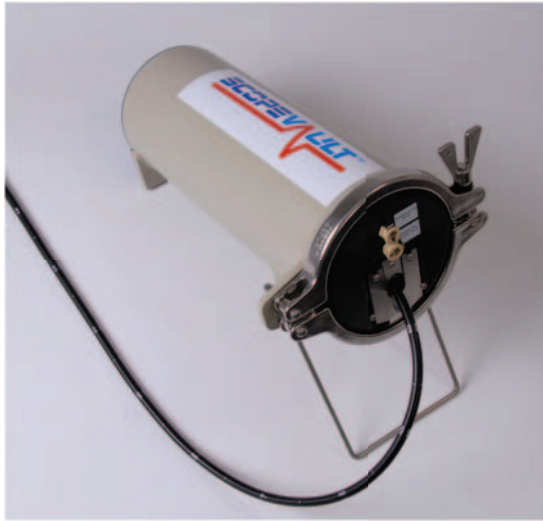
Figure 2. The Scopevault™ with trans-oesophageal echocardiography probe loaded

Approximately 20 test decontamination cycles using an obsolete TOE probe were performed during the development phase of the device. This initial testing period also allowed decontamination staff to become familiar with handling the TOE probes and avoiding potential damage. Following this a more formal testing protocol was performed over 100 cycles to specifically identify any pressure leaks and any signs of fluid ingress that could harm the fluid-sensitive portions of the TOE probes (see Appendix 1). No episodes of de-pressurisation or signs of fluid ingress occurred over the 100 cycles.